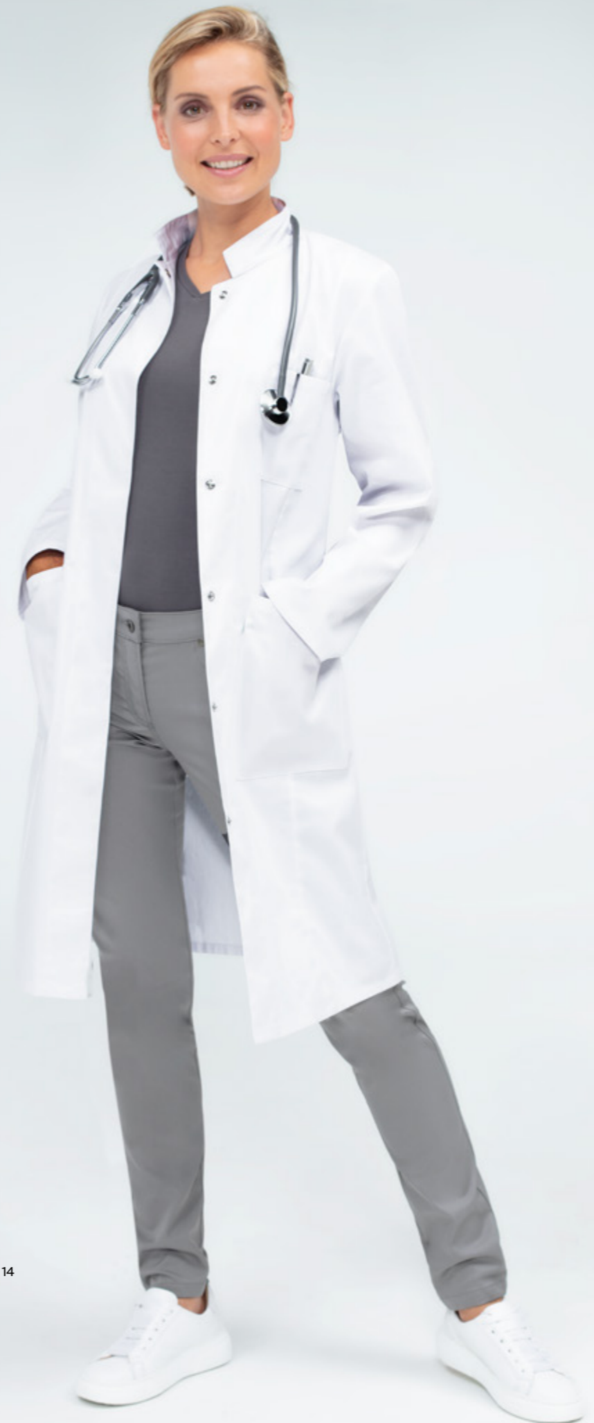
Ladies trousers page 14